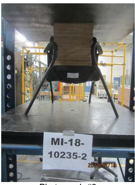
Photograph #3 Chair after peak load reached