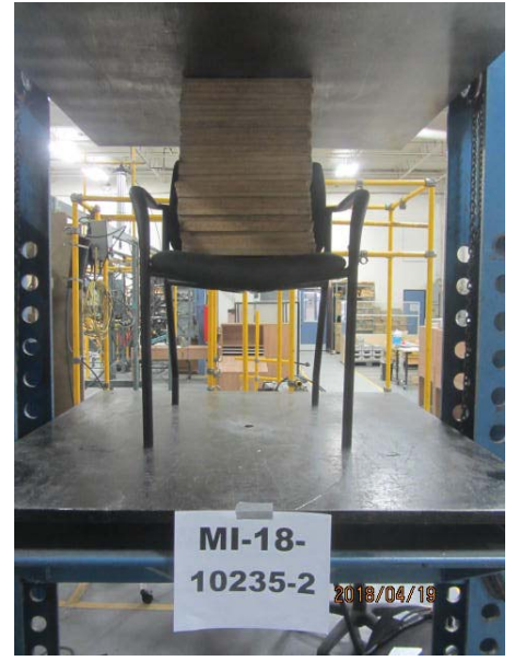
Photograph #2 Chair before loading

The chair started to bend upon 3944 lbf load application