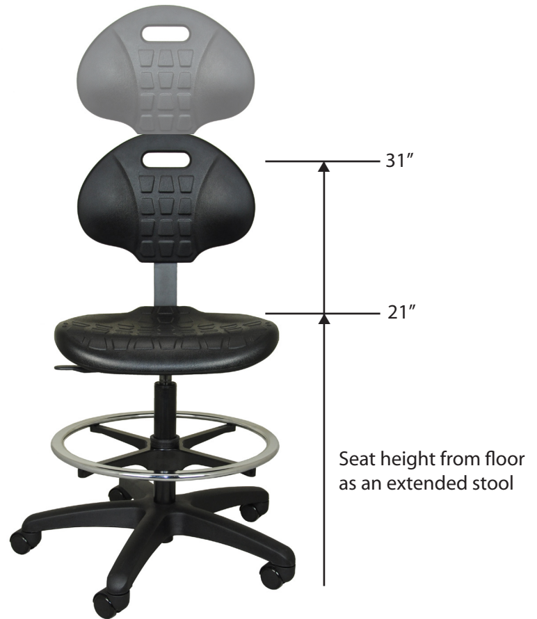
Model UR4001 XSP